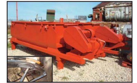
STOCK CODE: N10211-10 2000L S/S U-TROUGH MIXER