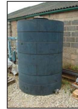
STOCK CODE: N10318-07 4500L BLACK POLYPROP ENCLOSED TANK 1600MM DIA X 2400MM