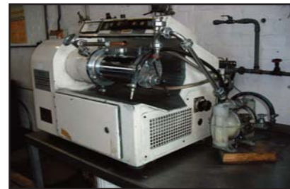
STOCK CODE: N10310-12 1L NETZSCH HOZ BEAD MILL LMJ1 3KW