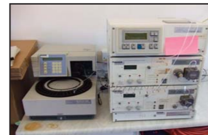
STOCK CODE: N10330-51 CECIL ION LIQUID CHROMATOGRAPH