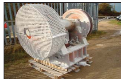
STOCK CODE: N9882-11 GOODWIN BARSBY JAW CRUSHER