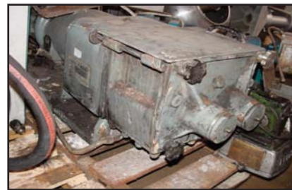
STOCK CODE: N9598-59 6L BAKER PERKINS NEBAN BLADE SS JKTD MX