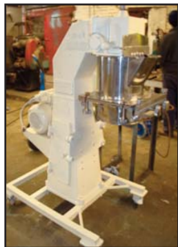
STOCK CODE: N8953-11 CROCKET GRANULATOR 300MM DIA NO.4 S/S