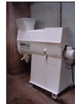
STOCK CODE: N9189-10 110L S/S GARDNER U-TROUGH MIXER