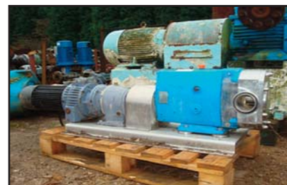
STOCK CODE: N10187-34 18 LPM ALFA LAVAL SRU4079LS LOBE PUMP