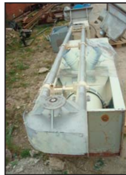
STOCK CODE: N9404-39 POWDER FLIGHT S/S TUBULAR ELEVATOR 4M LIFT