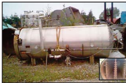
STOCK CODE: N8181-06 4600 L M/S HORIZONTAL AUTOCLAVE 50 PSI