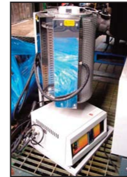
STOCK CODE: N9594-50 CARBOLITE VERTICAL SPLIT TUBE FURNACE 1200 DEG.C