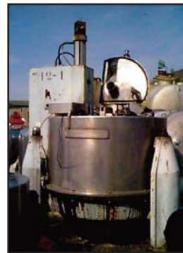
STOCK CODE: N7275-17 BROADBENT 46A S/STEEL PLOUGHING CENTRIFUGE 600MM DEEP