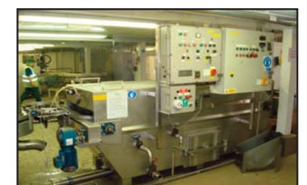
STOCK CODE: N10268-23 S/S BOTTLE WASHER AND COOLER