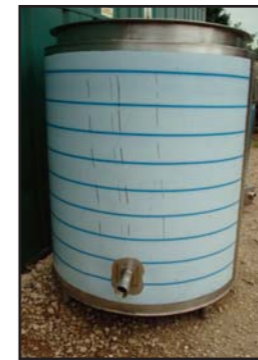
STOCK CODE: N9223A-04 1100L S/S ELEC HEATED JKTD TANK 1140MM DIA X 1190MM DEEP