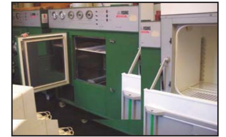
STOCK CODE: N9235-50 600L FISON ENVIRONMENTAL CABINET