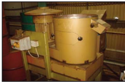
STOCK CODE: N10282-49 SIMON HEESSEN ORBITAL PELLET PRESS