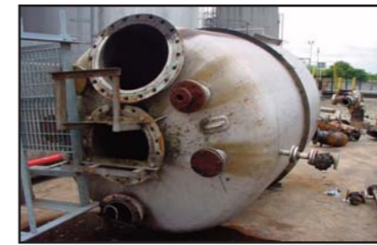
STOCK CODE: N9837-05 4600L S/S VERTICAL PRESSURE VESSEL