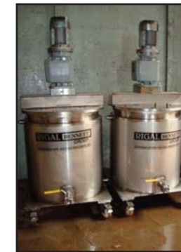
STOCK CODE: N10172-01 110L S/S ELEC PADDLE MIXER TANK 0.75KW NEW AND UNUSED