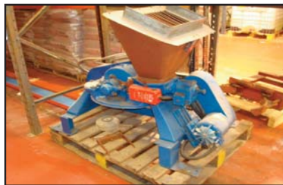
STOCK CODE: N10001-11 MIKROPUL M/S SWING HAMMER MILL 1SH