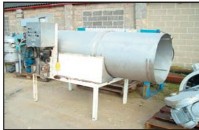
STOCK CODE: N9962-24 CRETORS S/S ROTARY COATER FT-650