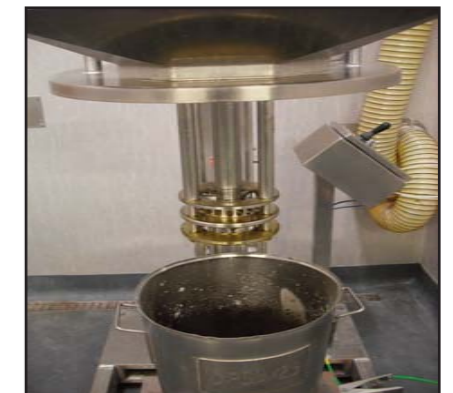
STOCK CODE: N10316-03 DUPLIX DP3 S/S SHEARHEAD MIXER 4KW 1000MM LONG SHAFTS WITH DUPLIX HEAD