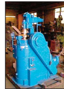
STOCK CODE: N8026-26 COURTOY 20 HEAD ROTARY TABLET PRESS R33