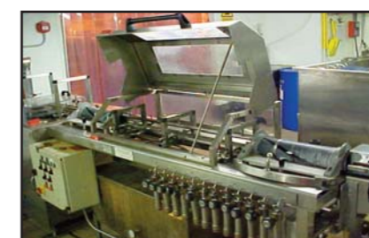
STOCK CODE: N10267-23 HILLS S/S MIRACLEAN BOTTLE WASHER