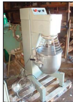
STOCK CODE: N10219-09 40L CRYPTO PEERLESS BOWL S/S MIXER EM40