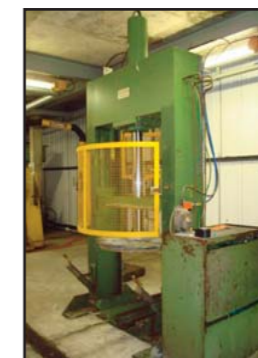
STOCK CODE: N9908-23 MOLTENI/ TURELLO DRUM DISPENSING UNIT FLP