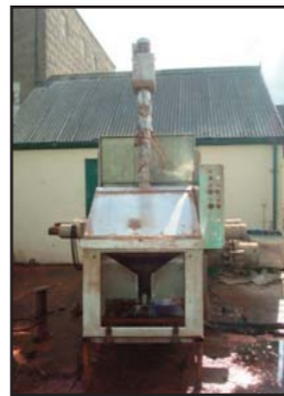
STOCK CODE: N10357-39 S/S SACK TIPPING ELEVATOR CONVEYOR