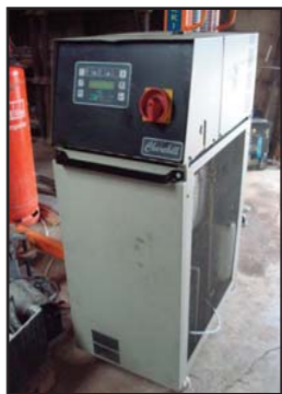
STOCK CODE: N10350-22 12KW CONAIR OIL HEATER 150 DEG.C.