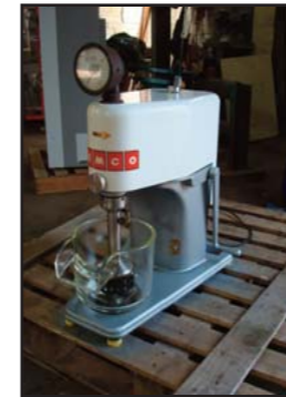
STOCK CODE: N9622-50 0.25KW WEMCO SHEARHEAD STIRRER