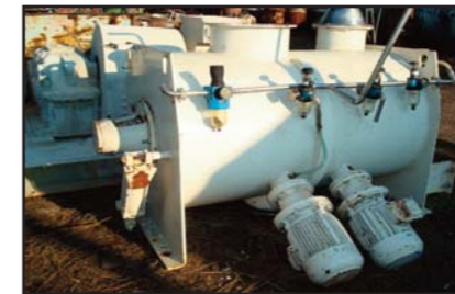
STOCK CODE: N10112-10 400L LODIGE S/S PLOUGHSHEAR FKM600D