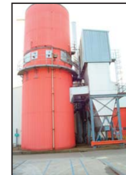
STOCK CODE: RC1057A-13 NIRO SPRAY DRIER GAS FIRED 480KG/HR