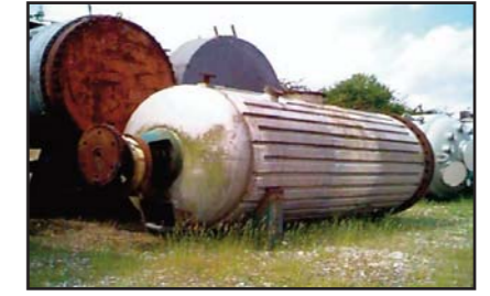
STOCK CODE: N7395-13 BUSS 6000L S/S PADDLE VACUUM DRIER