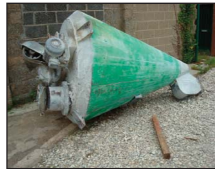
STOCK CODE: N10301-10 1250L S/S NAUTA MIXER WITH ORBITAL MIXER SCREW 1800MM DIA X 2200MM TALL