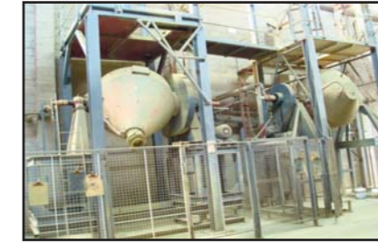
STOCK CODE: RC1158-13 2000L S/S JKTD DOUBLE CONE VAC DRIER