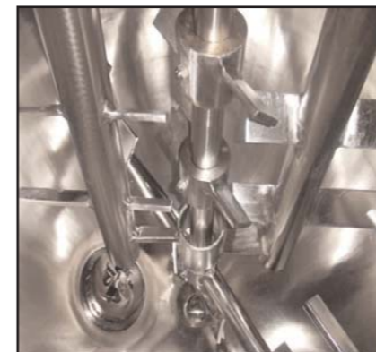
STOCK CODE: N10326-01 500L S/S GIUSTI SCRAPED SURFACE MIXER FULL VACUUM/1 BAR. TEST PRESSURE 1.5 BAR