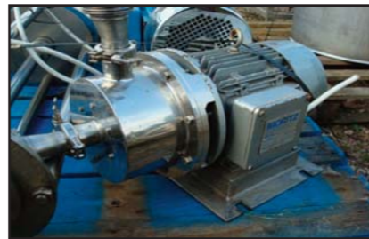
STOCK CODE: N10085-03 4KW S/S MORITZ TR100 INLINE SHEAR MIXER