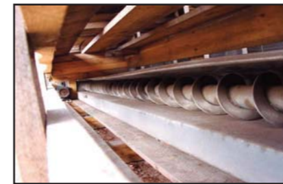
STOCK CODE: N9626-39 SCREW CONVEYOR S/S U SECT. 150 X4000