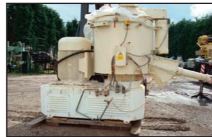
STOCK CODE: N10021-09 600L PAPERMEIER HIGH INTENSITY MIX TS630