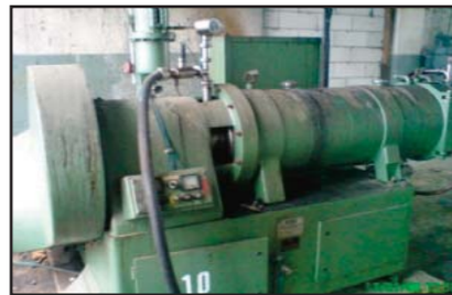
STOCK CODE: N9940-12 200L S/S HOZ NETZSCH BEAD MILL 75KW