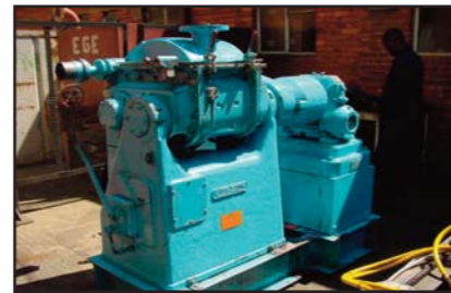
STOCK CODE: N9842-09 45L BAKER PERKINS S/S JKTD VACUUM MIXER