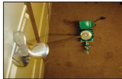
STOCK CODE: S9468-03 1.1 KW CLAMP ON STIRRER 1440 RPM