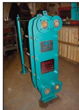
STOCK CODE: N8421-19 3 SQ.M. APV PLATE HEAT EXCHANGER TYPE HXU6