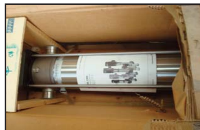
STOCK CODE: N10353-33 160 LPM GRUNDFOS PUMP TYPE CRN10 S/S