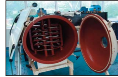
STOCK CODE: N8126-13 APV MITCH. HALAR LINED 5 TRAY VAC OVEN