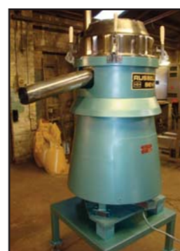
STOCK CODE: N9741-16 RUSSELL 560MM DIA S/S SINGLE DECK DALEK SIEVE