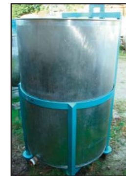
STOCK CODE: N10034-07 700L S/S OPEN TOP TROLLEY TANK 920MM DIA X 1200MM DEEP