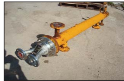
STOCK CODE: N9318-19 1.4 SQ.M. SHELL & TUBE HEAT EXCHANGER