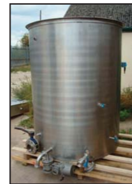
STOCK CODE: N10332-07 2750L OPEN TOP MIXING TANK S/S 1500MM X 1870MM DEEP