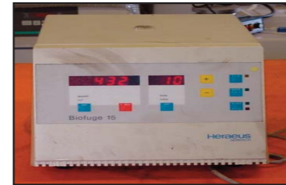
STOCK CODE: S9872-50 HERAEUS BIOFUGE 15