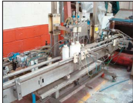
STOCK CODE: N10359-23 NODSTOP S/S TWIN HEAD FILLER UP TO 1L AIR OPERATED. SCHOTT GLASS FILL CHAMBER