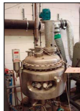
STOCK CODE: RC1170-01 HASTALLOY JACKETED REACTOR 120L. 600MM X 460MM DEEP