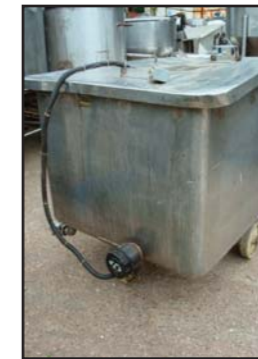
STOCK CODE: N10315-04 700L S/S ELEC. HEATED RECT. TANK 900MM X 1280MM X 700MM DEEP