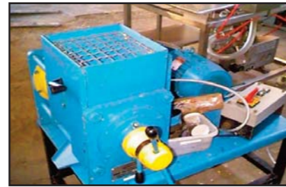
STOCK CODE: N8586-24 DESMET ROSEDOWN MINI 40 OIL EXPELLER