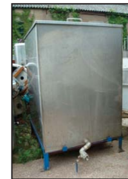
STOCK CODE: N10314-07 1400L S/S RECT. TANK 1000 X 1200 X 1300MM TALL