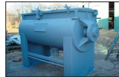
STOCK CODE: N9989-10 1000L S/S JKTD GARDAM U-TROUGH MIXER