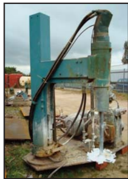
STOCK CODE: N10050-03 37KW TORRANCE HYDRAULIC RAISE/LOWER SAWTOOTH MIXER