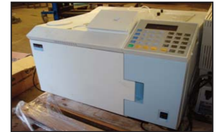
STOCK CODE: N10233-51 P/ELMER AUTOSYS GAS CHROMATOGRAPH