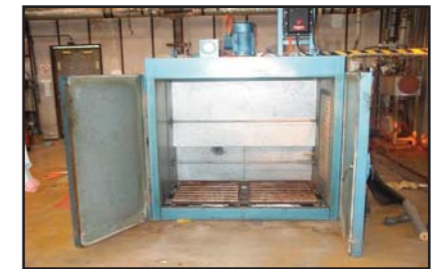
STOCK CODE: RC297A-13 HEDINAIR STEAM HEATED CHAMBER OVEN