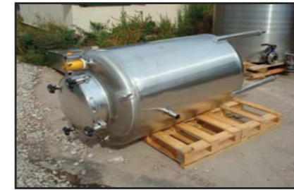
STOCK CODE: N10333-07 500L S/S ENCLOSED VERTICAL TANK