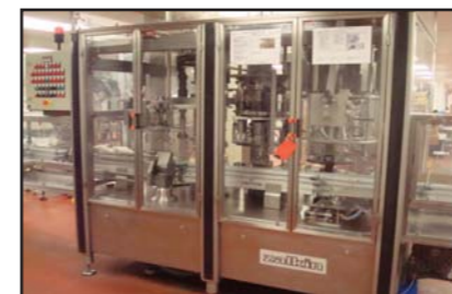
STOCK CODE: RC1190-23 ZALKIN 3 STAGE CAPPER CA4/4/4