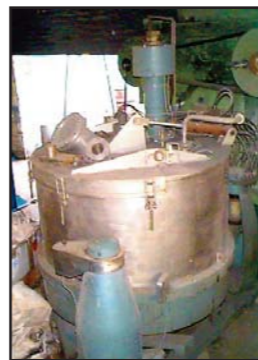
STOCK CODE: N7585-17 ESCHER WYSS S/S 1250 MM DEEP PLOUGHING CENTRIFUGE