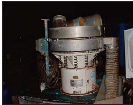
STOCK CODE: N10284-16 600MM DIA S/S SWECO SINGLE DECK SIEVE TYPE LS24-S-44. DRIVEN BY 0.25KW MOTOR