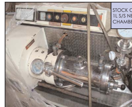
STOCK CODE: N10310-12 1L S/S NETZSCH HOZ BEAD MILL LMJ1 3 KW CHAMBER 80MM DIA X 220MM LONG