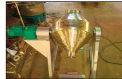
STOCK CODE: N7366-10 110L S/S DOUBLE CONE BLENDER 1.5KW