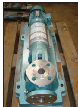
STOCK CODE: N10338-33 10 LPM S/S I/DRESSER TYPE 50-320 PX125