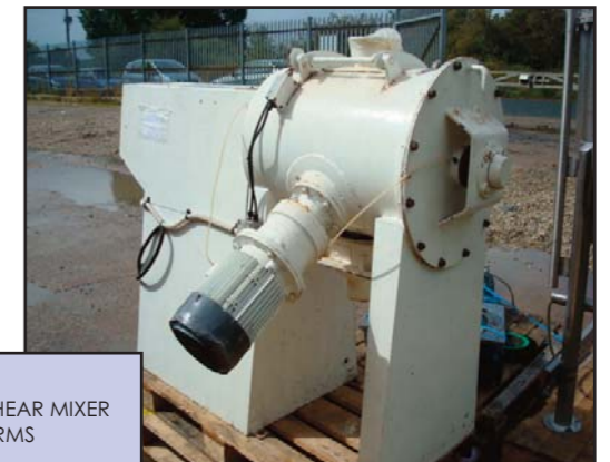
STOCK CODE: N10327-10 80L WINKWORTH S/S PLOUGHSHEAR MIXER RT80 WITH T-ARM TYPE MIXER ARMS