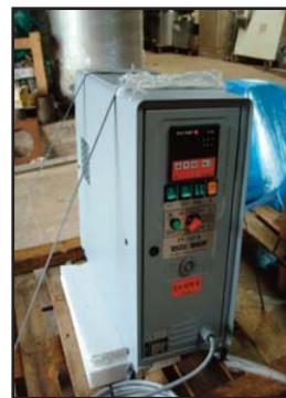
STOCK CODE: N10331-22 TOOL-TEMP T1157 9KW WATER/OIL HEATER