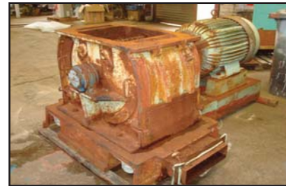
STOCK CODE: N8887-11 CHRISTY NORRIS PULVERISER TYPE 18B12