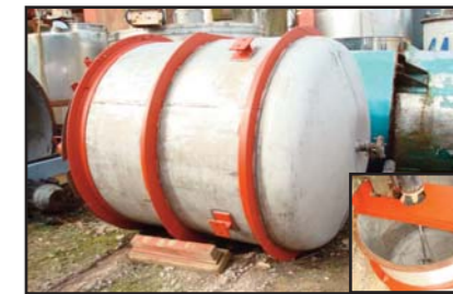
STOCK CODE: N10051-07 2200L S/S OPEN TOP TANK 1530MM DIA