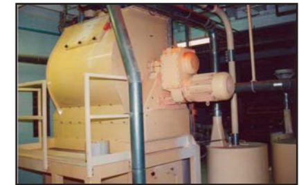
STOCK CODE: RC1185-10 BUHLER BLENDING SYSTEM 10T/HR