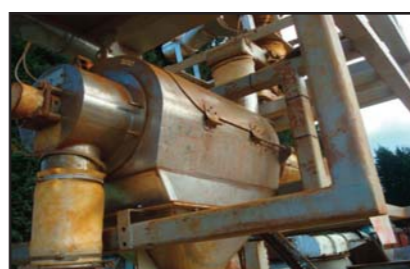
STOCK CODE: N10254-16 KEK S/S ROTARY SIFTER 150 DIA 610MM FACE