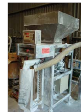
STOCK CODE: RC1193-23 30 KG SINGLE HEAD S/S VALVE SACK FILLER