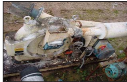
STOCK CODE: N9291-11 KEK MILL SIZE 3H MILD STEEL