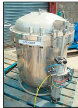
STOCK CODE: N9977-06 130L S/S VERTICAL AUTOCLAVE T.P. 8 BAR