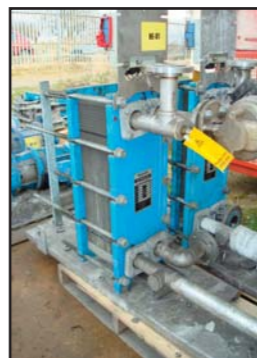
STOCK CODE: N9928-19 16 SQ.M. RYCROFT PLATE HEAT EXCHANGER