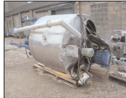
STOCK CODE: N10317-02 2100L S/S ENC COMBINATION MIXING TANK 1560MM DIA X 1200MM DEEP. DISH BOTTOM