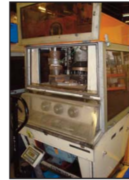
STOCK CODE: N10045-26 FETTE KILMATEX 28 STATION ROTARY TABLET PRESS