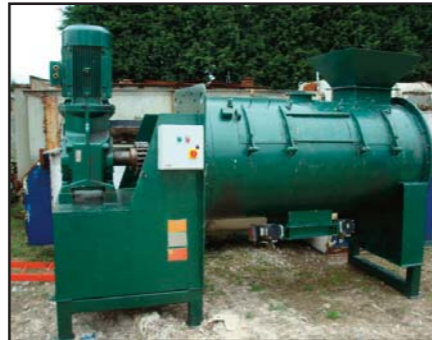
STOCK CODE: N10137-10 1000L S/S WINKWORTH RT1000 S/S 30KW T-ARM BATCH MIXER