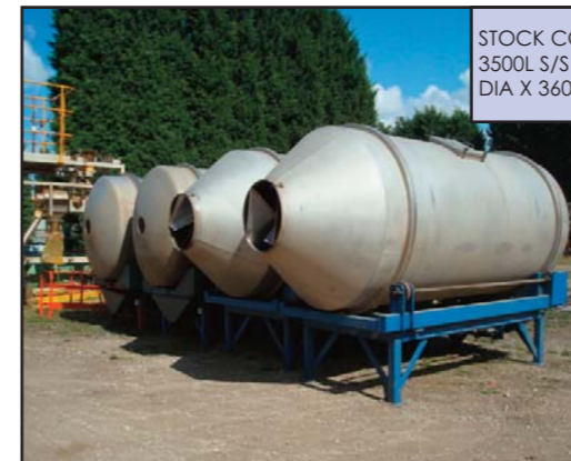
STOCK CODE: RC1173-10 3500L S/S TUMBLE MIXER BLENDER 1800MM DIA X 3600MM LONG WITH DISH END