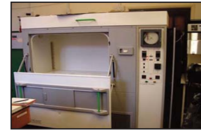
STOCK CODE: N9236-50 650L GALLENKAMP ENVIRO CABINET