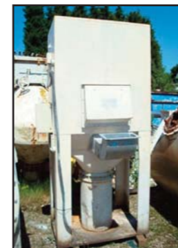
STOCK CODE: N9990-40 DCE UMA253 G5 UNIMASTER DUST COLLECTOR