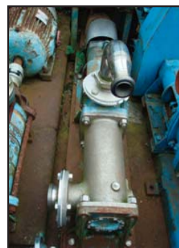
STOCK CODE: N7213-34 115 LPM MONO PUMP TYPE SH70 S/S