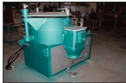
STOCK CODE: N8185-10 T.K. FIELDER RAPID H/SPEED MIXER HMA150