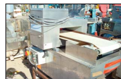
STOCK CODE: N9872-23 LOMA METAL DETECTOR 350MM X 120MM