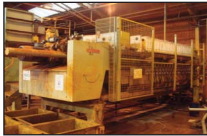
STOCK CODE: RC1160D-18 EDWARDS & JONES FILTER PRESS 1300MM