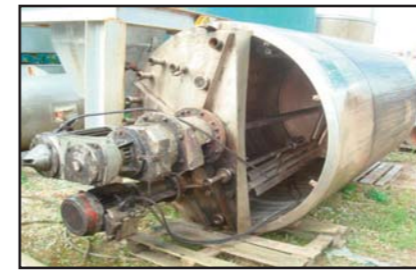
STOCK CODE: N10179-01 5000L SS JKTD ANCHOR COMBINATION MXR