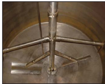
STOCK CODE: N10313-01 6250L S/S VERTICAL JACKETED MIXING TANK 2000MM DIA X 2000MM DEEP