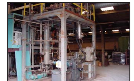
STOCK CODE: N9176-14 BUSS-LUWA VERT. 2 STAGE EVAPORATOR