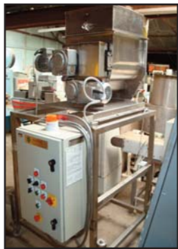
STOCK CODE: N9970-39 S/S SCREW FEEDER 100MM DIA X 950MM LONG AUGER