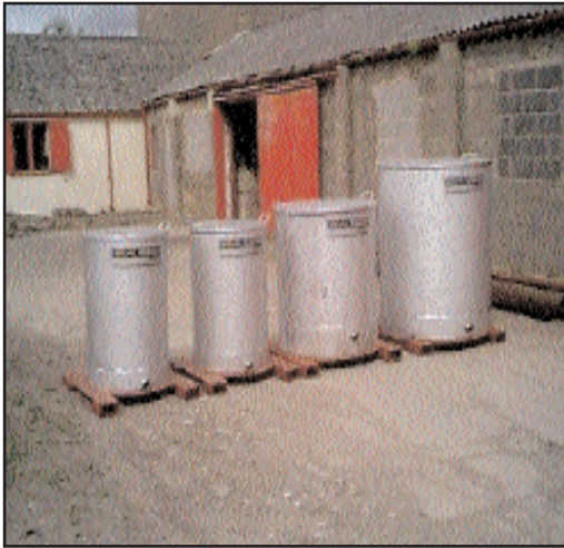
RIGAL BENNETT GROUP - DF range of stainless steel tanks.